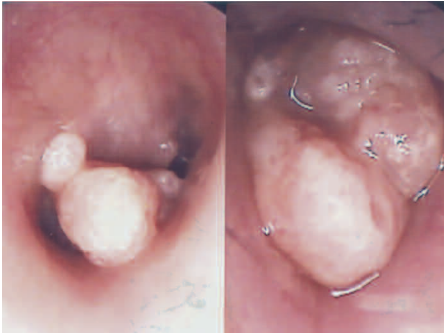
Figure 1. Otoendoscopic images of large masses protruding from middle ears on admission. The patient was initially treated with local injection of triamcinolone with continuation of previous oral corticosteroid regimen (30 mg/day). Because the effect was insufficient, carbon dioxide laser vaporization was performed every few weeks.

charge demonstrated heavy content of eosinophils with no significant microorganisms, including fungi, and otoendoscopy showed large masses protruding from bilateral middle ears