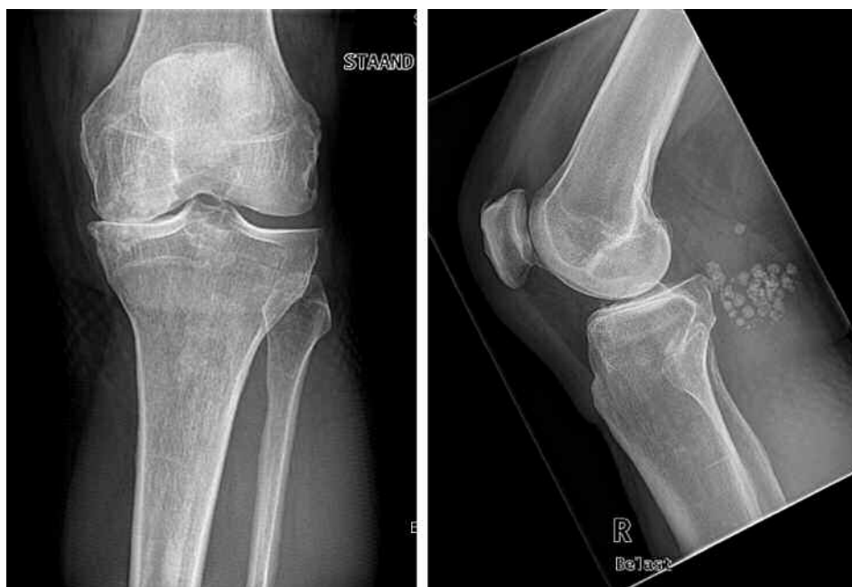
Figure 2. Radiography reveals multiple round or ovoid ossified loose bodies dorsally to the right knee joint and signs of osteoarthritis.