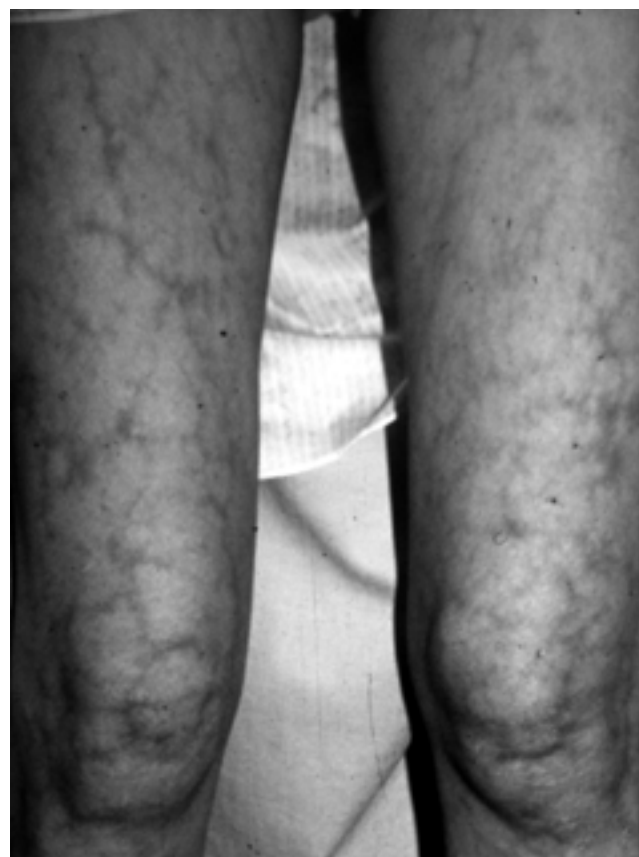
Figure 1. Livedo reticularis in a patient with antiphospholipid (Hughes) syndrome.

When asked their opinion, the students attending our clinics stated that evidence for APS was not convincing: "no history of thromboembolic disease," "no history of multiple miscarriages," "cardiolipin antibodies negative." Clearly, in their view, "Hughes syndrome" sounded more like the patient's own name rather than the antiphospholipid (Hughes) syndrome. Confusion remained: did she describe "Mrs. Hughes syndrome," a carefully built pathomimic simulation, or a true Hughes syndrome? Extensive and fixed livedo reticularis of lower limbs (Figure 1) and lupus anticoagulant positive on 2 previous occasions clarified the diagnosis. There was little