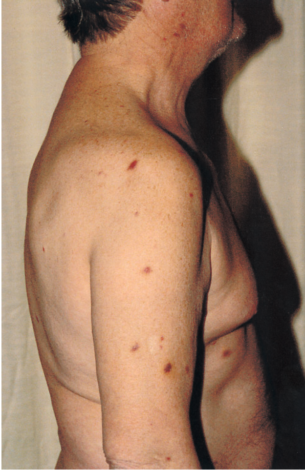
Figure 1. Cutaneous lesions in a patient with Wegener's granulomatosis and Kaposi's sarcoma.